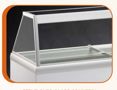
SERVE OVER GLASS COUNTER*