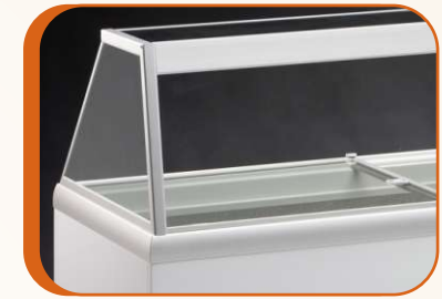
SERVE OVER GLASS COUNTER*