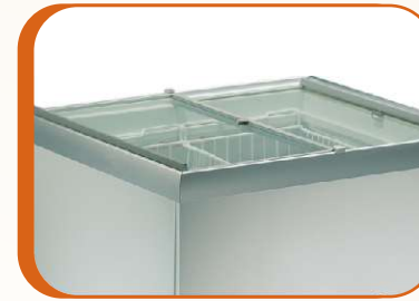
FLAT SLIDING GLASS LIDS